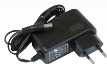
24V 0.38A Power adapter