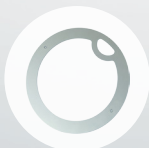
Ceiling mount base