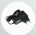
24V 0.38A Adapter