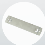
Ceiling mount attachment